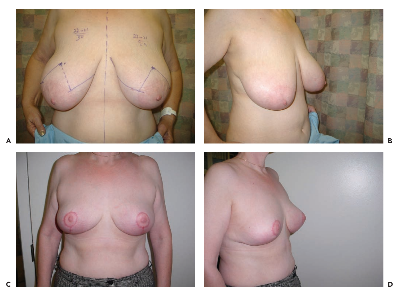
Figure 94.1. A: Preoperative sternal notch-to-nipple distance is 30 cm on the right and 29 cm on the left. The inframammary fold is at 22 cm bilaterally and the neo–nipple-areolar complex will be sited at 21 cm bilaterally. B: Oblique view. C: Postoperative result at 3 months, frontal view. D: Postoperative result at 3 months, oblique view.

Finally, a horizontal line is drawn from the inferior end point of the vertical lines to the IMF. They need not extend all the way to the medial extent or the lateral extent of the breast—a pearl gleaned from experience with the vertical-only approach. The horizontal lines meet the IMF at 1 to 4 cm from the lateral sternal border and roughly at the lateral limit of the breast crease (Fig. 94.1).